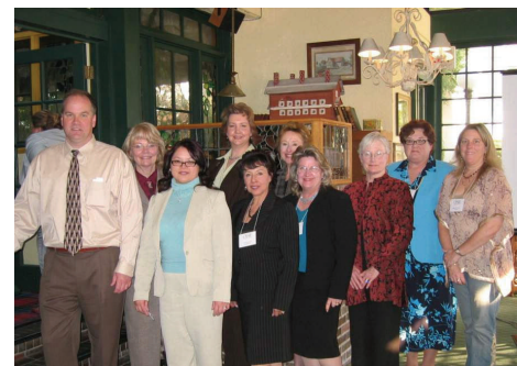
OHE 2007 Board of Directors: