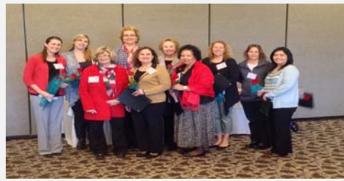
January 18, 2015